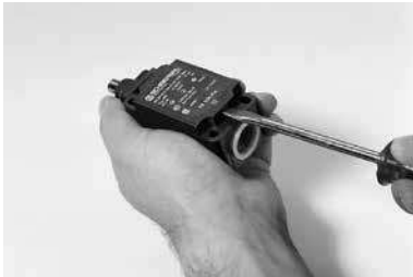
Z/T 336: opening the cover

According to EN 60204-1, the versions with connector must only be used in PELV circuits.